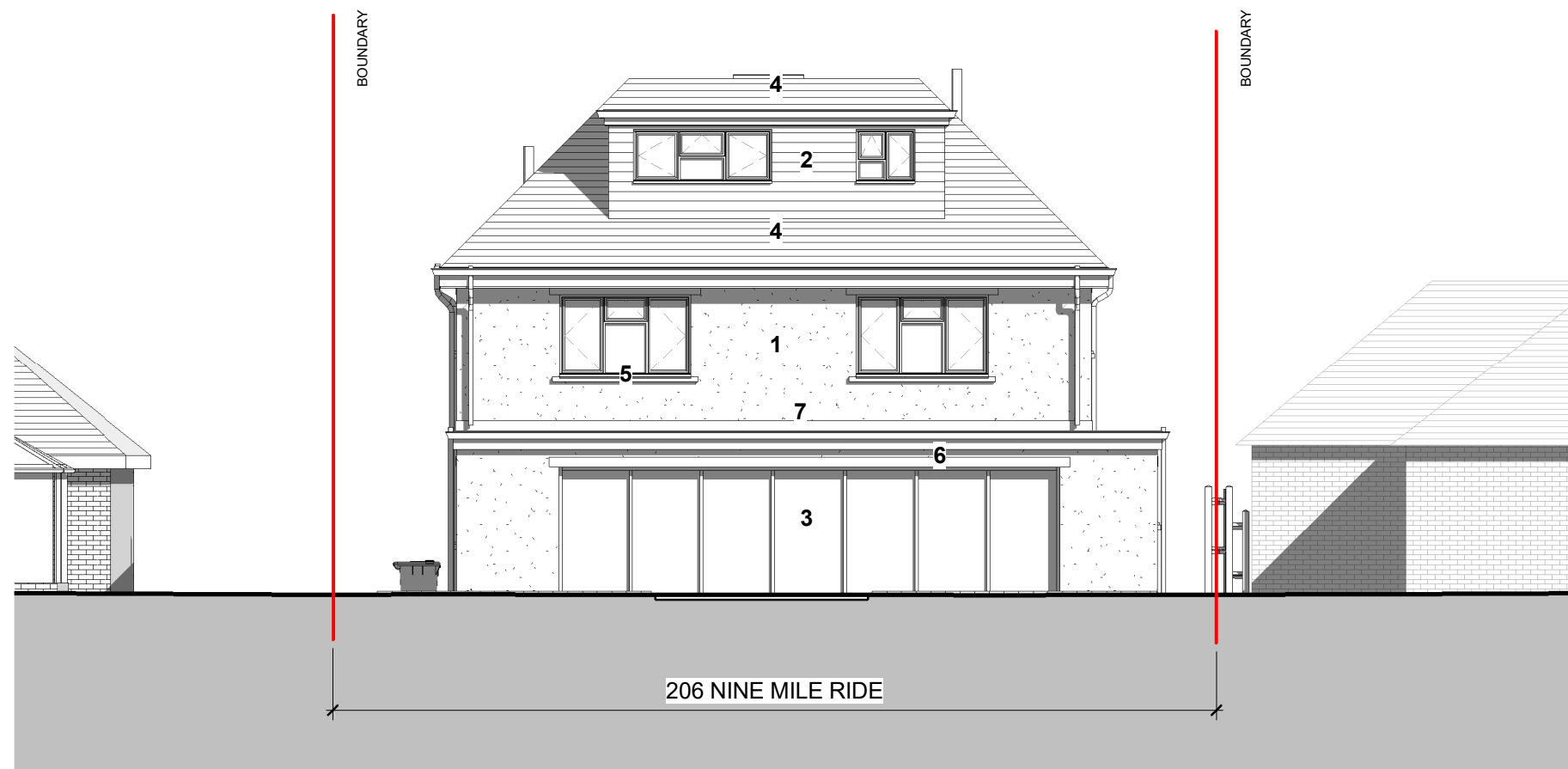
REAR ELEVATION - SOUTH